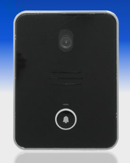
101-131 Flush Door Station