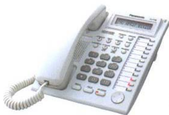
■ KX-T7730 LCD, Speakerphone Unit

* An optional card is required. Please contact your dealer or phone company to confirm if the Caller ID service is available in your area.