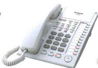
■ KX-T7720 Speakerphone Unit