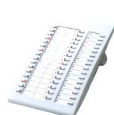
■ KX-T7740 DSS Console