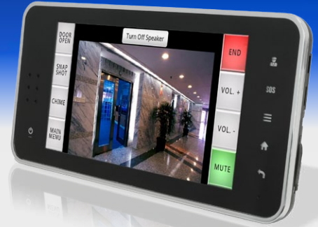
101-132 10" Indoor Touch Screen Room Station / Tablet