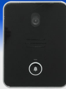
101-131 Flush Door Station