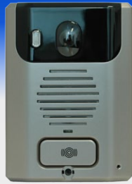
101-130 Surface Door Station